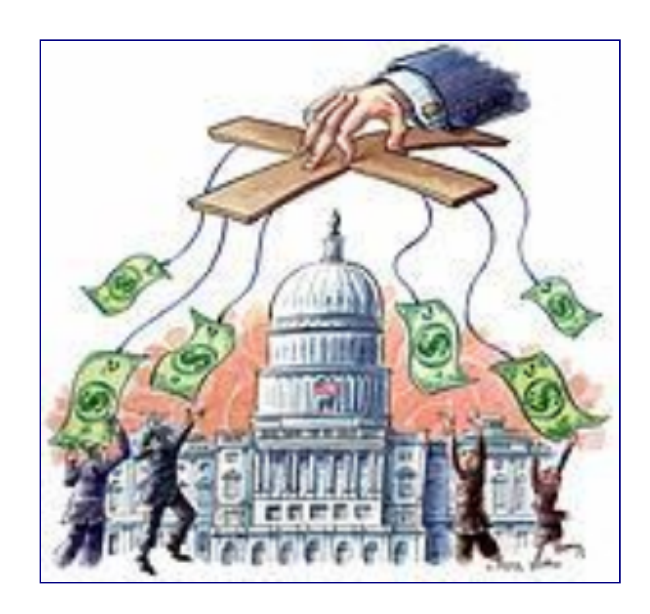
Government Partnerships and the Volkswagen Scandal

The media has been in a frenzy with the revelations that the Volkswagen automobile company manipulated information about emission standards on its diesel vehicles to deceive environmental regulators in both the United States and Europe. This is being portrayed by many in the media as another example and "proof" of the consequences of unbridled capitalism, when left outside of sufficiently tight and demanding government regulation and intense oversight.